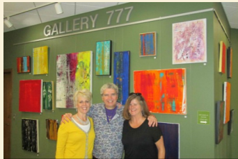
"Thunder Over Lightning" June/July 2014

This year we committed to enriching your library experience by opening Gallery 777 in June 2014. When we opened this Gallery, we were the only public space in Lisle to exhibit the work of local artists. We have a wealth of talent in Lisle, and the artists have welcomed and appreciated the chance to exhibit in their own town.