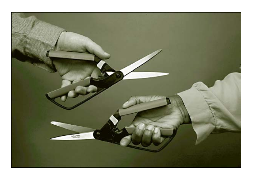
Right & left-handed scissors