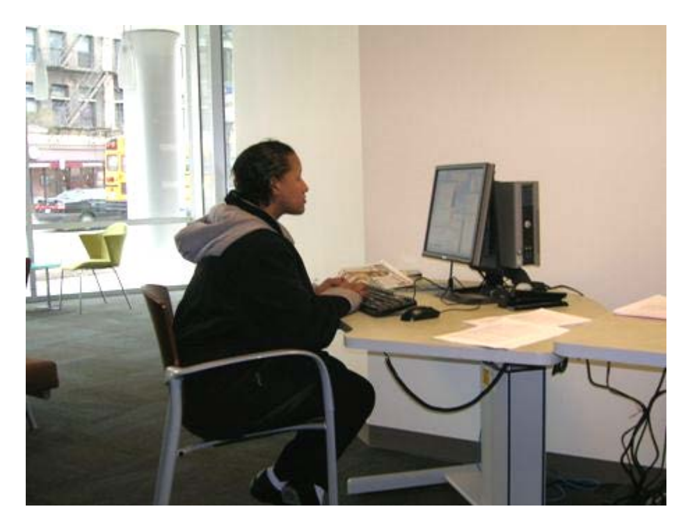
A user at a computer table. The table height can be easily adjusted to suit different user needs.

The design accommodates a wide range of individual preferences and abilities.