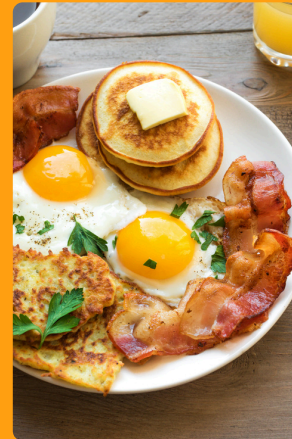
MAY 7 TH — BREAKFAST FOR DINNER