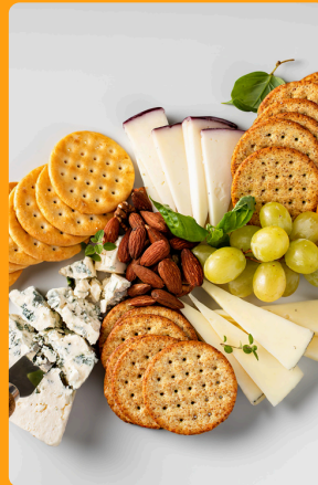
MARCH 5 TH — SNACKS