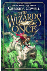
June 16 The Wizards of Once by Cressida Cowell