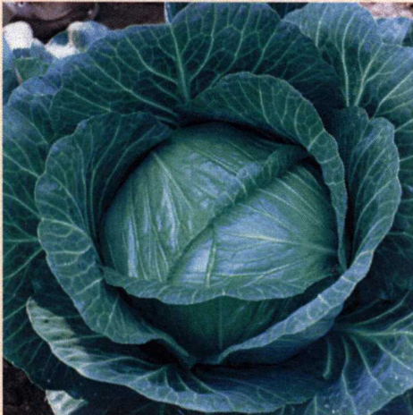
CABBAGE, BRUNSWICK Brassica oleracea