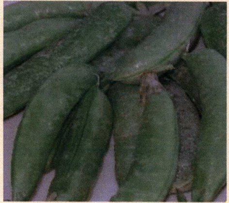
PEA, SUPER SUGAR SNAP Pisum sativum