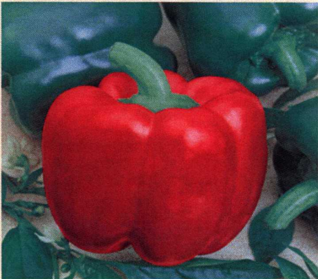
SWEET PEPPER, CALIFORNIA WONDER