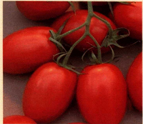
TOMATO, ROMA HEIRLOOM Lycopersicon esculentum