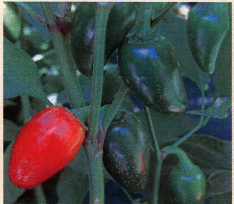
PEPPER, JALAPENO TRAVELER STRAIN