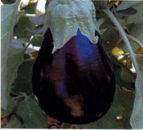
EGGPLANT, BLACK BEAUTY Solanum melongena