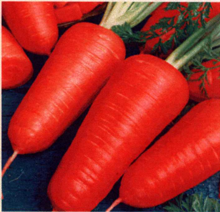
CARROT, CHANTENAY RED CORE Daucus carota