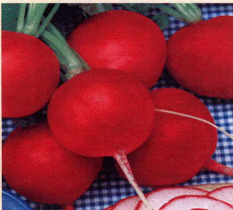
RADISH, CHAMPION Raphanus sativus