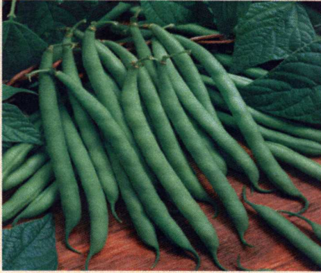
BEAN, BLUE LAKE 274 GREEN BUSH