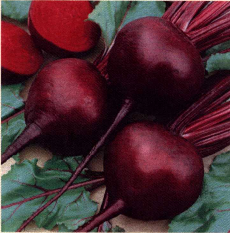
BEET, DETROIT DARK RED Beta vulgaris