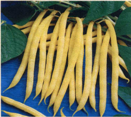
BEAN, GOLDEN WAX YELLOW Phaseolus vulgaris