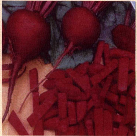
BEET, RUBY QUEEN Beta vulgaris