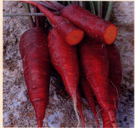
CARROT, DRAGON Daucus carota