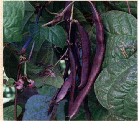
BEAN, PURPLE PODDED POLE Phaseolus vulgaris