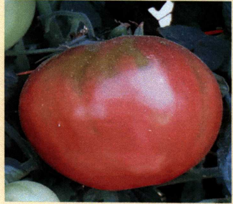
TOMATO, CHEROKEE PURPLE Lycopersicon esculentum