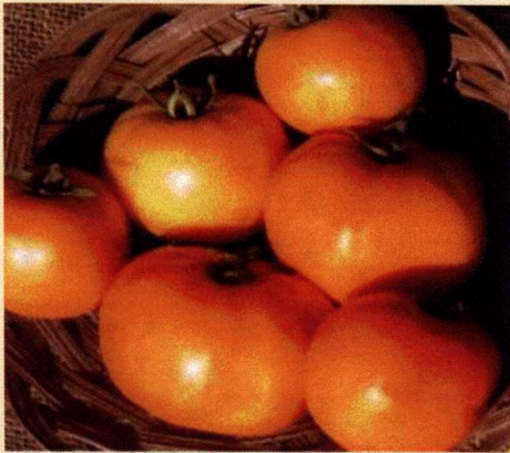
TOMATO, GOLDEN JUBILEE Lycopersicon esculentum