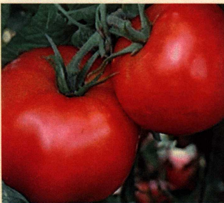
TOMATO, RUTGER'S HEIRLOOM Lycopersicon esculentum