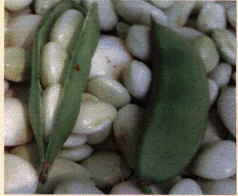
BEAN, BUTTER PEA LIMA Phaseolus lunatus