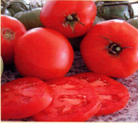
TOMATO, BRANDYWINE Solanum lycopersicum