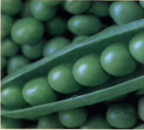
PEA, LINCOLN SHELL Pisum sativum