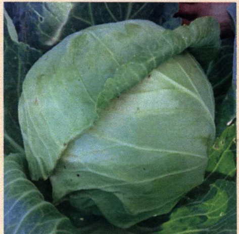
CABBAGE, COPENHAGEN MARKET Brassica oleracea